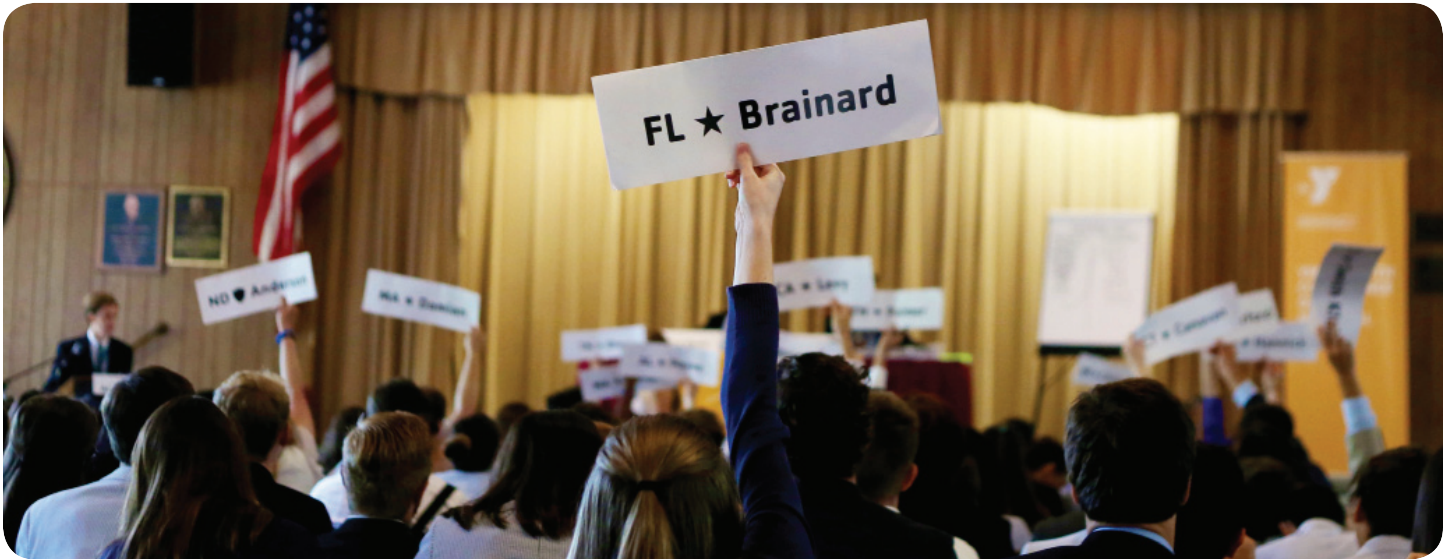
DELEGATE, PLEASE DISPLAY YOUR PLACARD ★ DELEGATES VIE FOR ATTENTION IN HOPES OF BEING CALLED ON DURING THE 2016 PLENARY SESSION

ERIN HENRY, NY; ASHLEY HATCH, CO ★ STAFF WRITERS